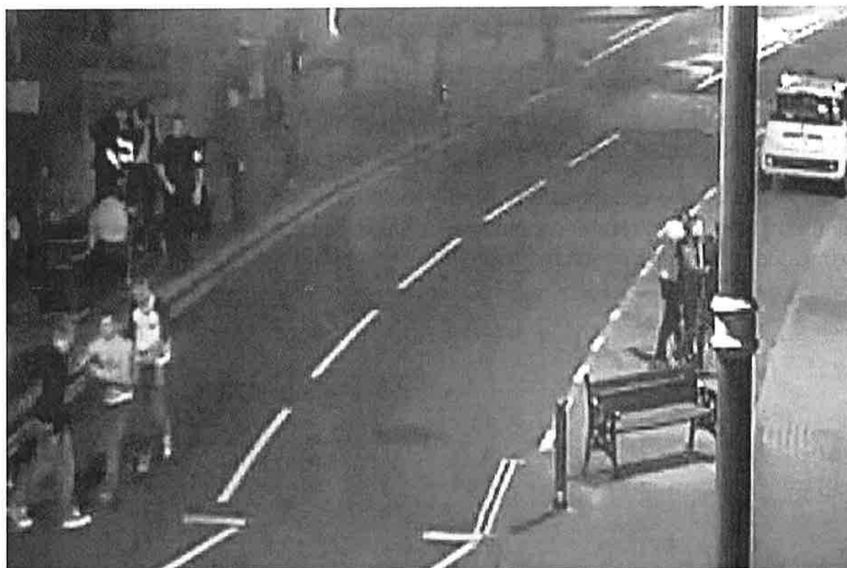
Police have released a CCTV of the fight

Police are appealing for witnesses to the mass fight outside a bar in the seaside resort and have released a CCTV image